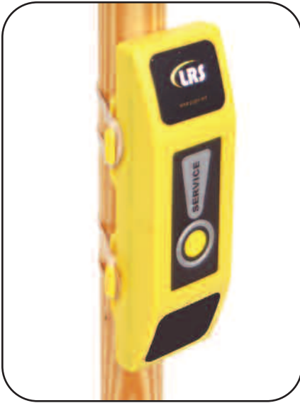
Beach Butler can also be mounted with rubber bands, Velcro strips or optional umbrella clip.