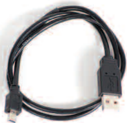
Programming CD (not shown) and cable.