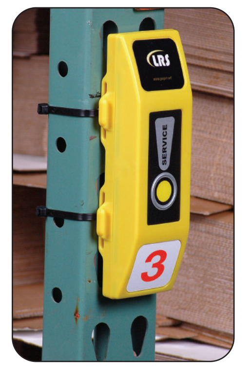
Mount it on a pole with Velcro Strips or Rubber Bands (both included).