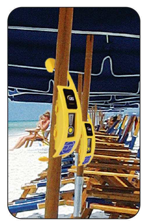
Shown attached to a beach chair with the Umbrella Clip (optional).