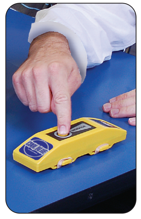
Mount it on a table so guests can page for service.