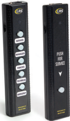
Butler II Pushbutton Paging Transmitter

That way your guests can relax...and so can you.