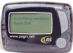
LRS Alphanumeric Staff Pager